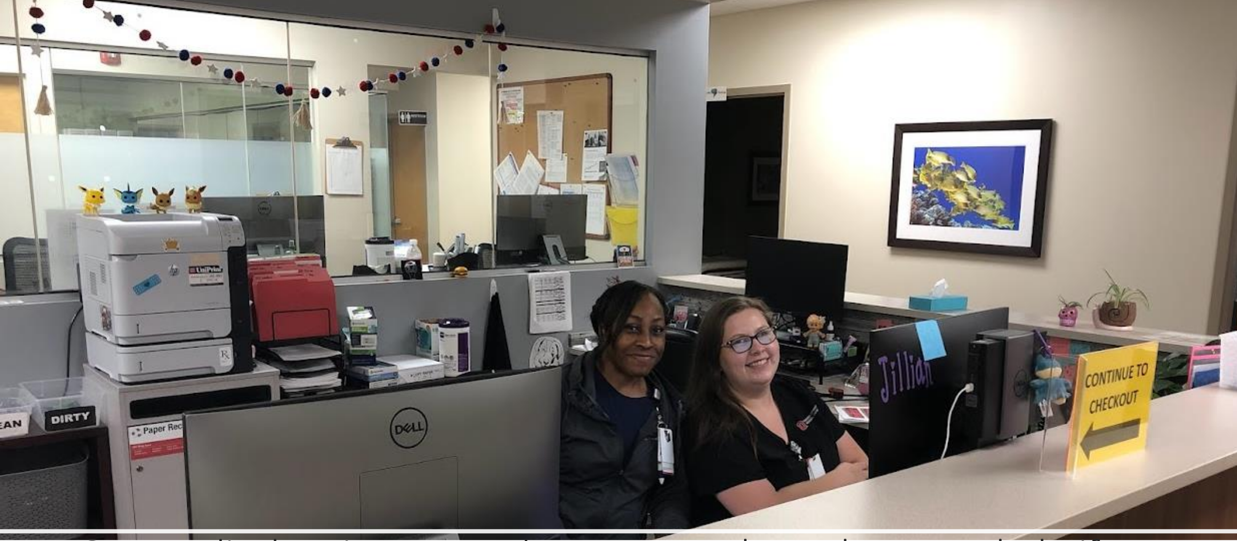
Our medical assistance and nurses are always happy to help if you need anything.