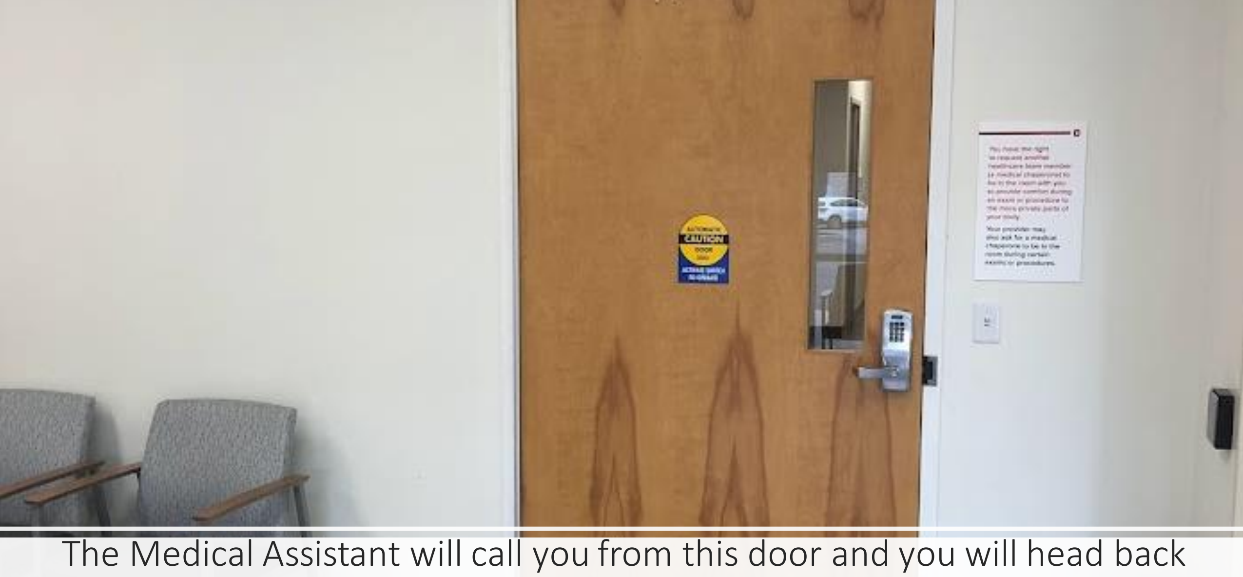
The Medical Assistant will call you from this door and you will head back to get your weight and taken to your room.