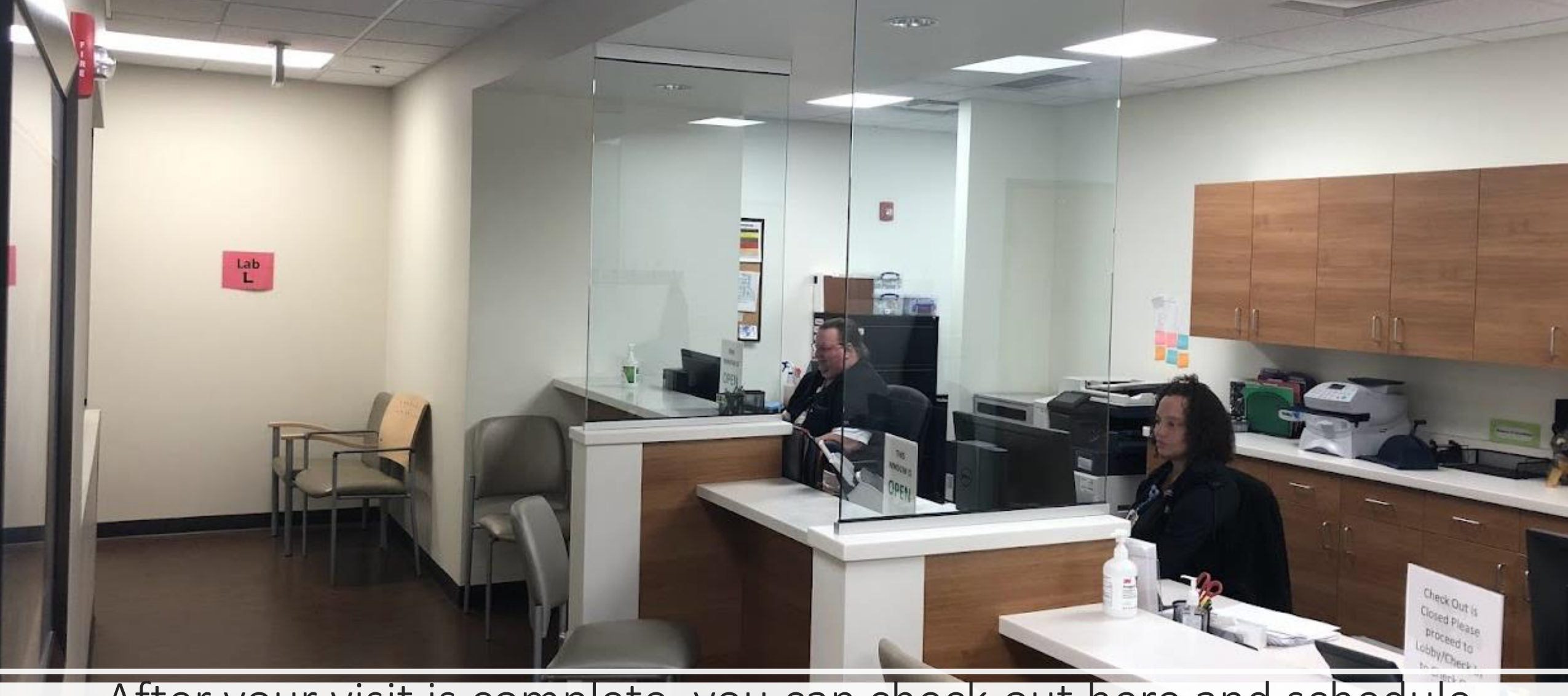
After your visit is complete, you can check out here and schedule your next appointment. Then you can go home.