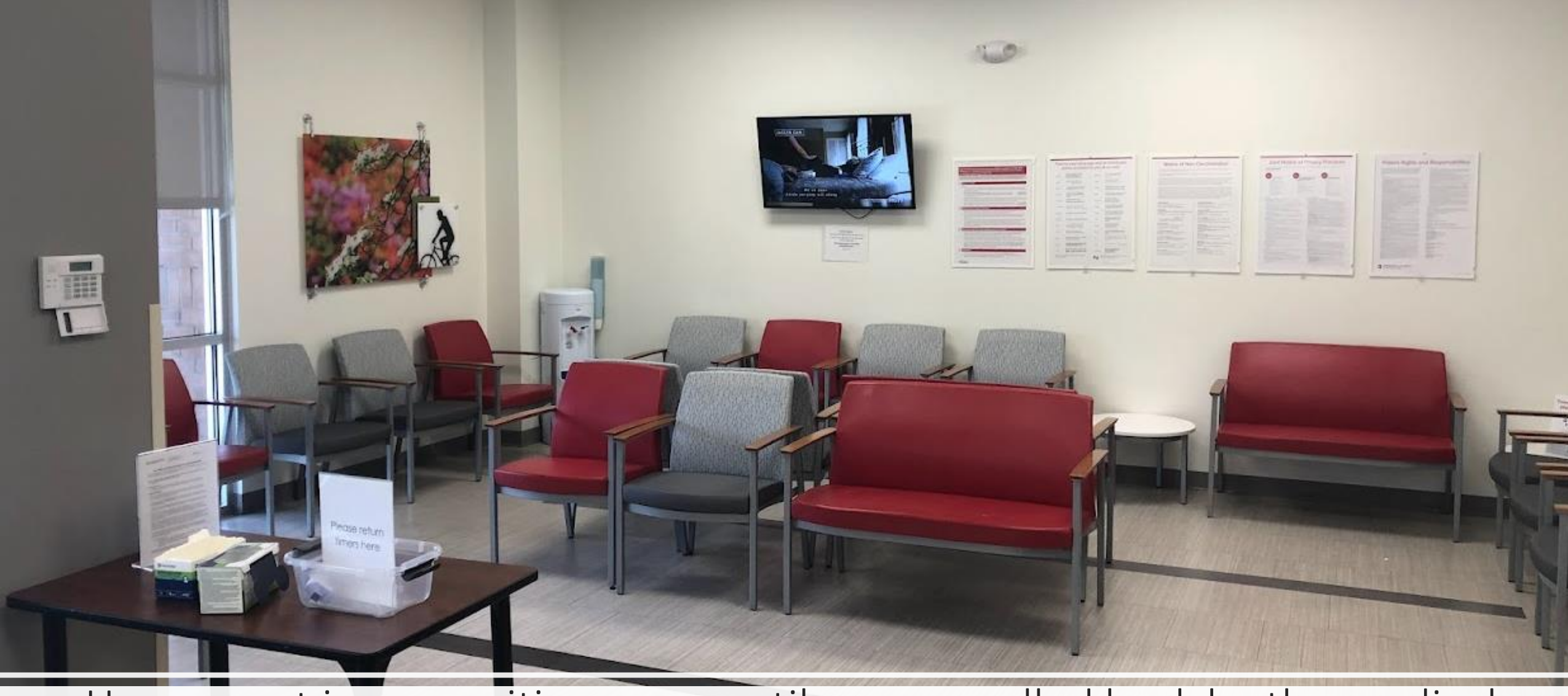
Have a seat in our waiting room until you are called back by the medical assistant.