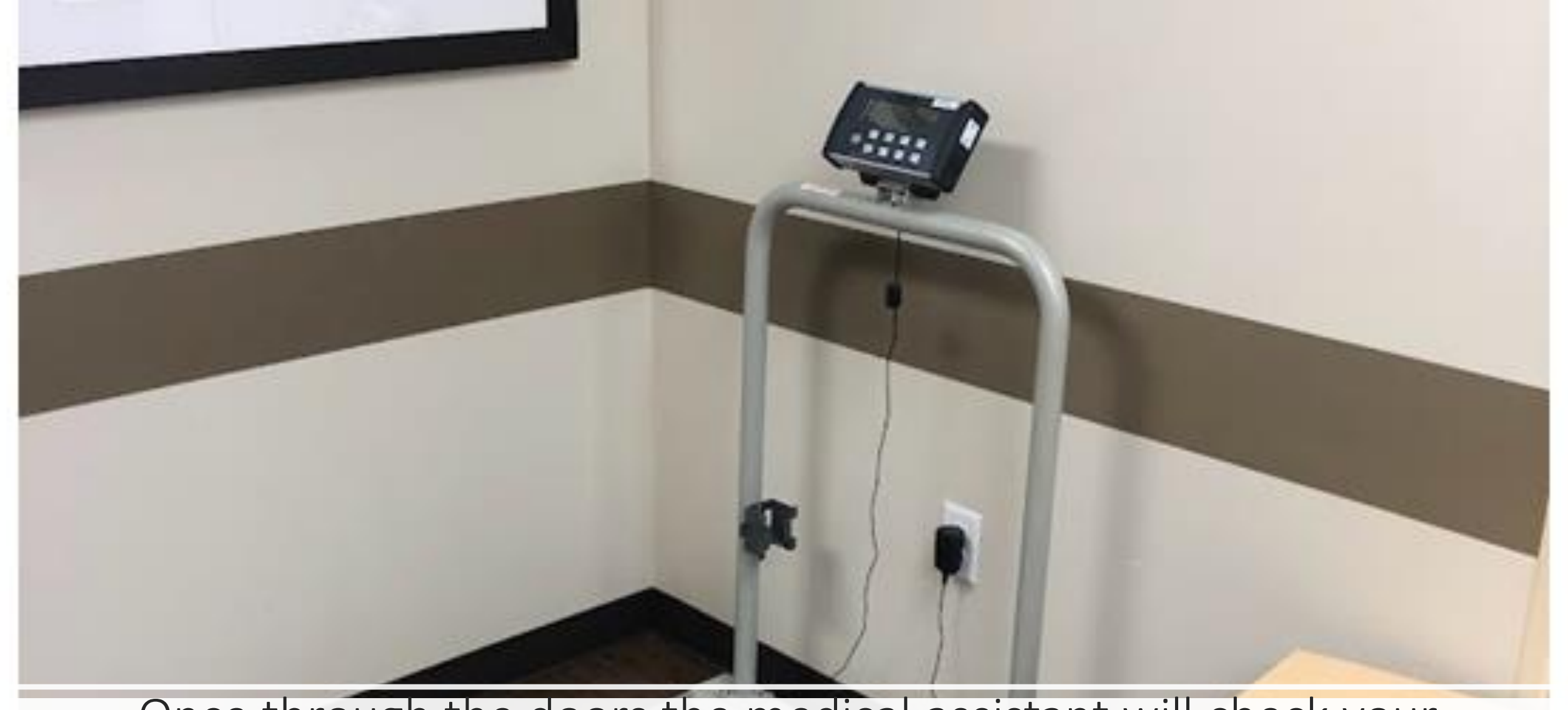
Once through the doors the medical assistant will check your weight here.