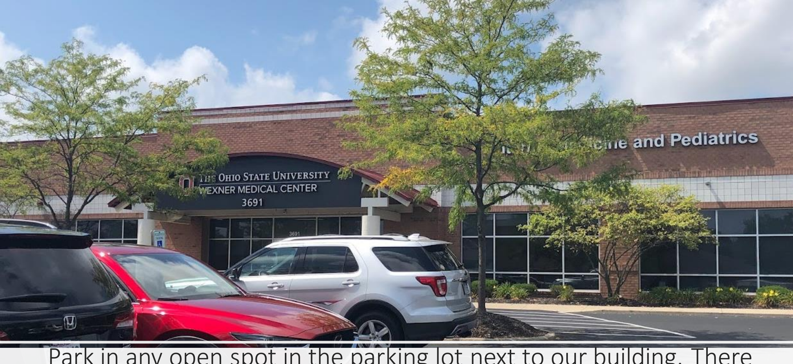
Park in any open spot in the parking lot next to our building. There is no cost for parking.