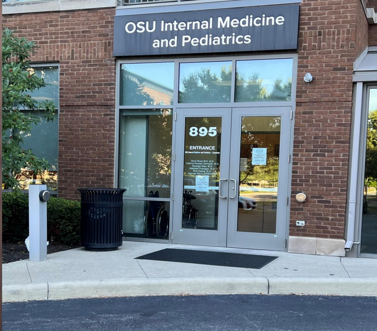
This is the Grandview office. 😊